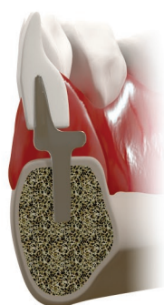
AccuFrame IC Direct transfer of occlusal loads to bone for optimal performance