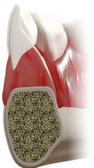
Traditional Denture No structural contact between occlusal surface and bone