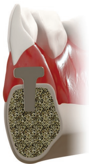
Fixed-Hybrid Frame engages bone but teeth supported via acrylic gingiva only